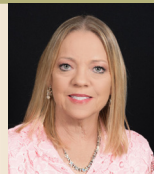
Outstanding Community Volunteer for Mental Health